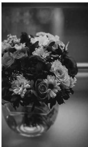
Not a photo of actual arrangement